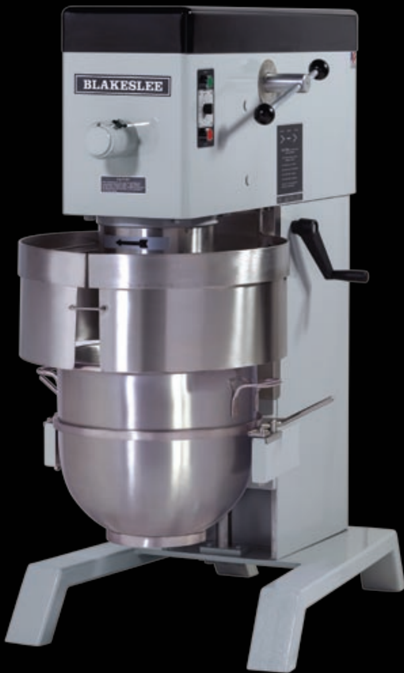
20-Quart (Bench, Floor & Cart-Mounted) Mixers