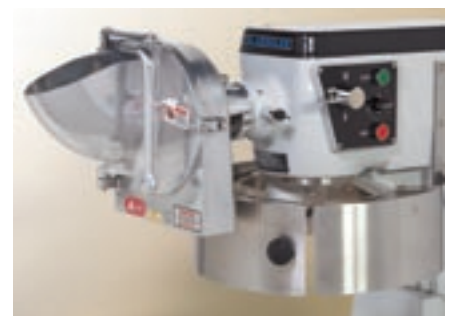
Every Blakeslee Mixer comes with a No. 12 PTO that can power accessories including the 9" vegetable slicer shown