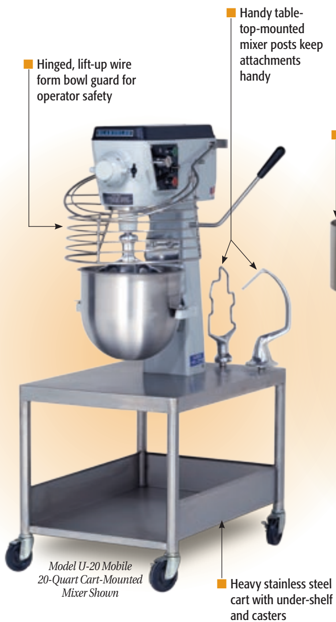
Model U-20 Mobile 20-Quart Cart-Mounted Mixer Shown