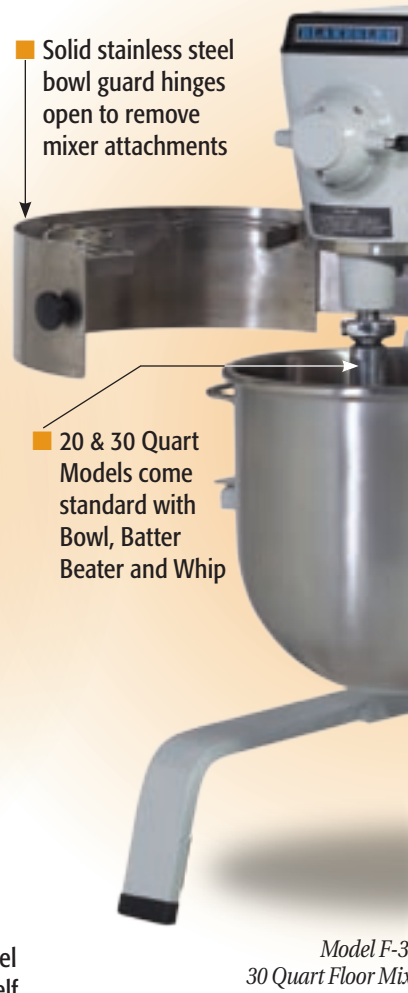
Model F-30 30 Quart Floor Mixer