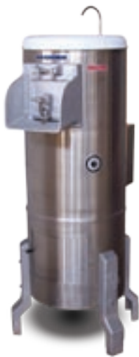
Model XC-15-T 15-20 Pound Peeler

Blakeslee potato and vegetable peelers can make short work of peeling potatoes and other root vegetables, with: