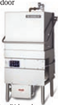
D-8 Single Tank Door-Type Dishwasher