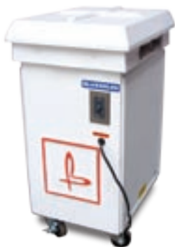
Model BB-914 Silver Saver™ Burnishing System

Blakeslee Burnishers can revitalize and restore your stainless or silver flatware with: