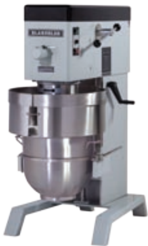
Model DD-80 80-Quart Floor Mixer

Blakeslee planetary mixers are legendary for their simplicity, durability, long life and superior mixing performance, with