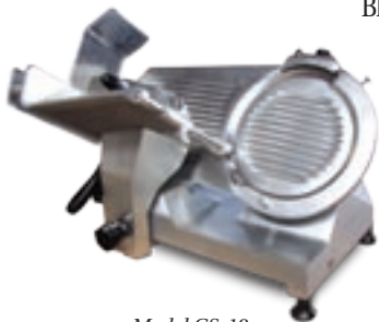
Model GS-12 Manual Slicer

Blakeslee Slicers are a cut above most gravity feed slicers, with: