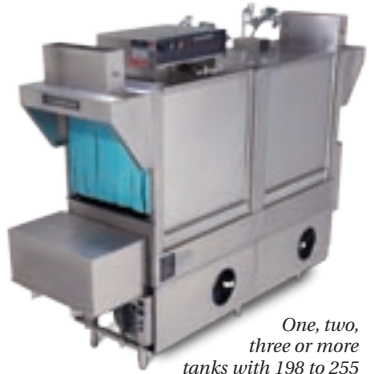
One, two, three or more tanks with 198 to 255 rack-per-hour capacity

A Blakeslee Rack-Type Dishwasher can be custom ordered for your dishroom with: