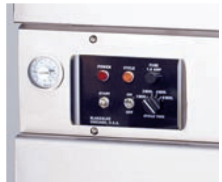
Simple controls are water resistant and flush mounted on unit front.