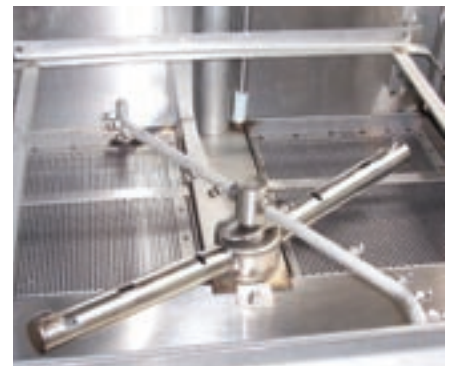
Separate Wash and Rinse Arms are designed for optimum cleaning and sanitation.