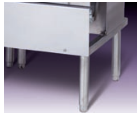
All stainless steel welded frame construction for durability, with oversize stainless legs...